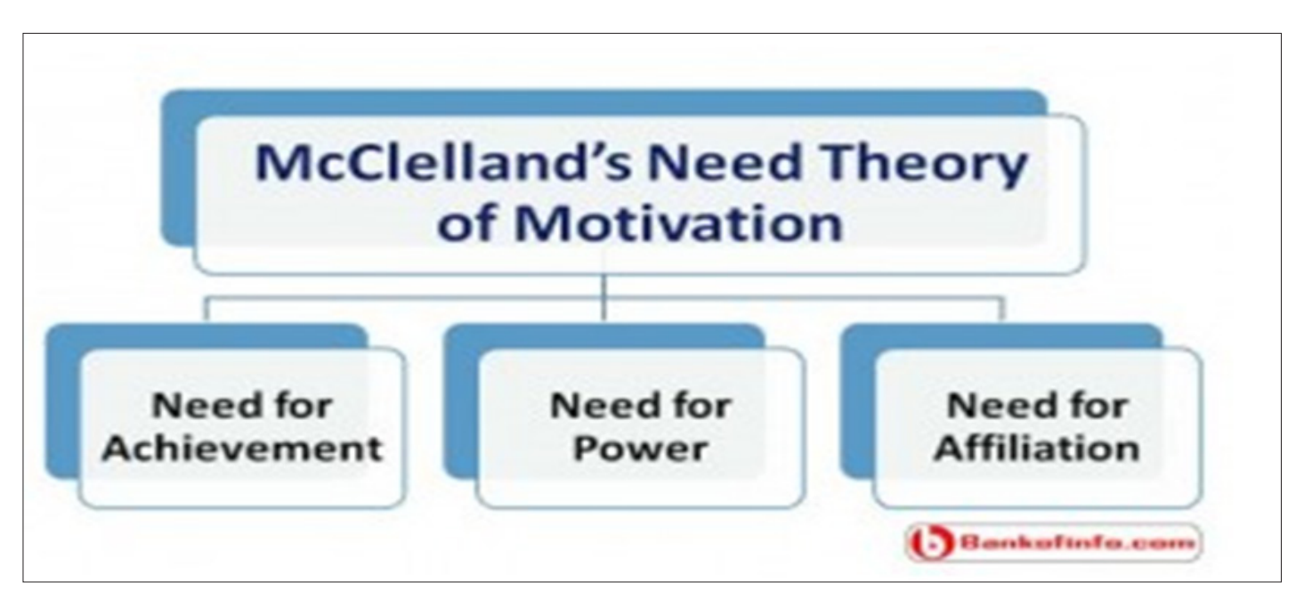
Figure 1: Theory of Motivation (McClelland, 1995)

Ha<sub>2</sub>: There is a significant relationship between selected business freshmen students' achievement competency and their business start-up intentions